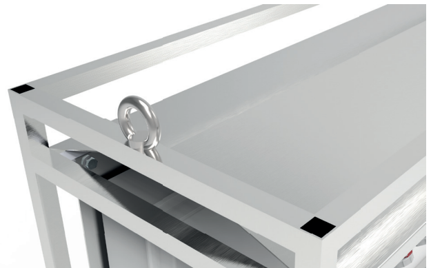
Easy transport using mounted lifting eyes.

Bals Elektrotechnik GmbH & Co. KG D-57399 Kirchhundem-Albaum Telefon: +49 27 23/771-0 Fax: +49 27 23/771-177/178 E-mail: info@bals.com Internet: www.bals.com